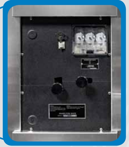
Emergency release built into door